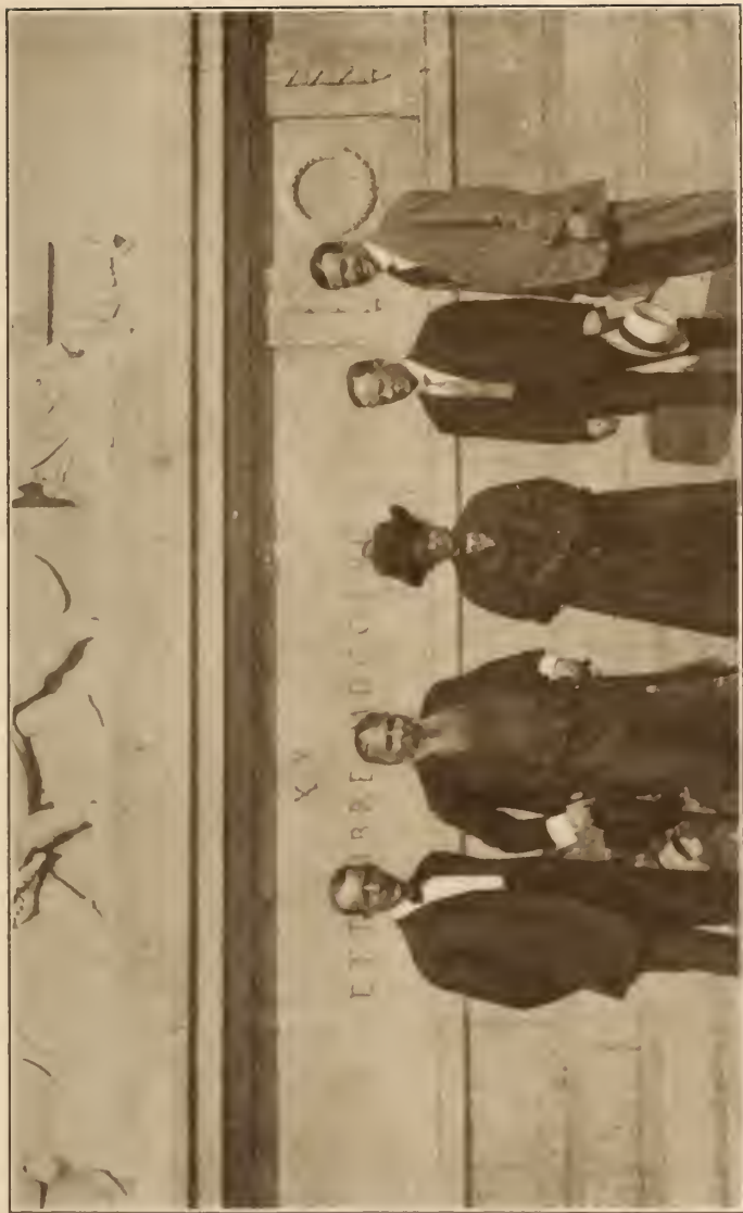
GENERAL AND MRS. RICCIO GARIBALDI AT THE FOOT OF HIS FATHER'S MONUMENT IN ROME.

"It is just like you Americans—you go to work to make your dreams come true."